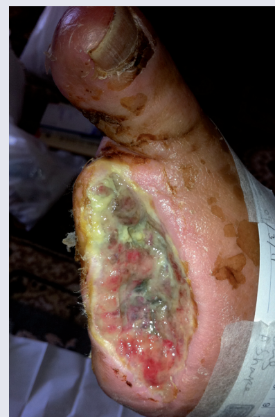
Figure 2: Wound at presentation, post-debridement. The wound is critically colonised. There are no signs of systemic or localised infection, therefore, the treatment focused on topical antimicrobials.

The wound exudate levels and the viscosity of the wound also implied that there was