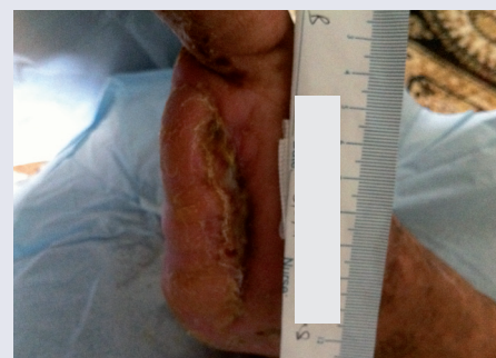
Figure 4: Wound bed is 100% granulated and there is no current need for antimicrobials, although their prophylactic use has been considered.

a high bacterial burden and if not treated appropriately the wound and the localised tissue could become infected. Therefore, the treatment plan was focused on the use of antimicrobial therapy.